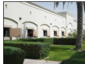
Dubai Equestrian & Polo Club

After the farm tour, we went to the Nad Al Sheba Race Track, where they were busy with preparations for the upcoming Dubai World Cup, the richest Thoroughbred race in the world. The building and track were beautiful. Much of the surrounding area was under construction, in keeping with the massive development Dubai is undergoing.