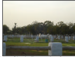
Paddocks at Sharja Equestrian Centre